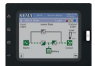
Advanced Touch Screen