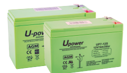
Optimized Battery Configuration 7/9Ah