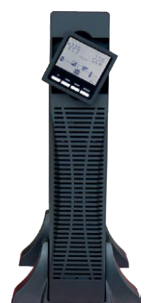
The LCD Panel Can be Rotated